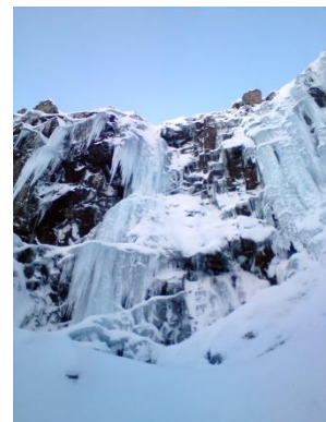
Looking up at 'Left Amigo' and 'Central Amigo'