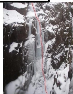
'Primero Pool'