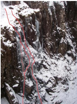
'Jumble', showing LH, RH and dotted unclimbed Direct Finish