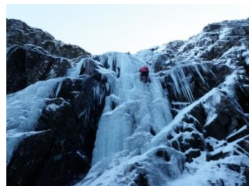
'Primero Pool' Climber: Simon Yearsley