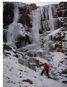
'The 3 Amigos' Climber: Neil Silver